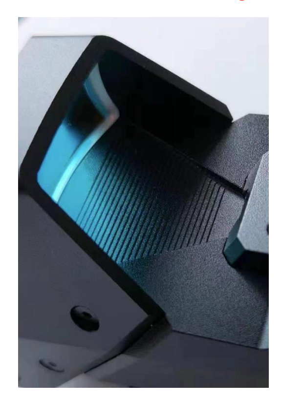
High Light transmittance and zero distortion, accurate measurement.