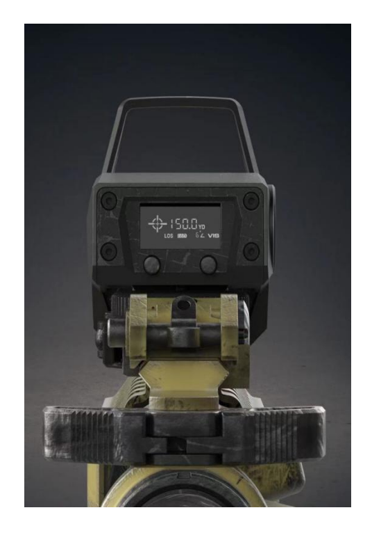
Aviation aluminium housing for life-time shock-proof.